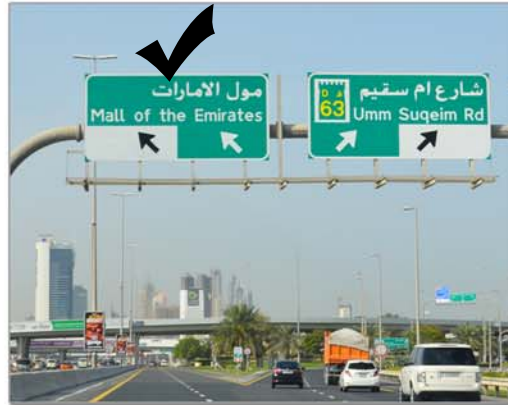
2. Follow Mall of Emirates