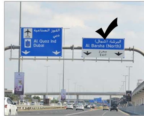
3. Follow Al Barsha North.