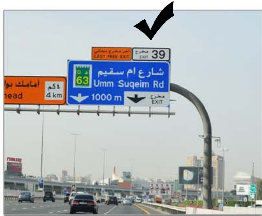
1. Take Exit 39. Umm Suqeim