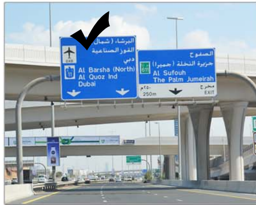
2. Follow Al Barsha North.