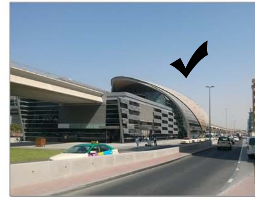
4. Follow Sharaf DG Metro Station and go straight from Round About.