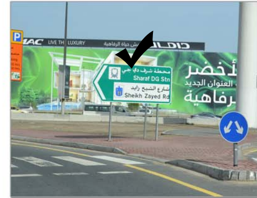
4. Follow Sharaf DG Metro Station Lane