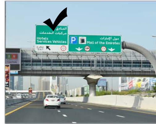
3. Follow Hotels & Services Vehicles Lane