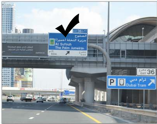
1. Take Exit 36. Al Sufouh, The Palm Jumeirah